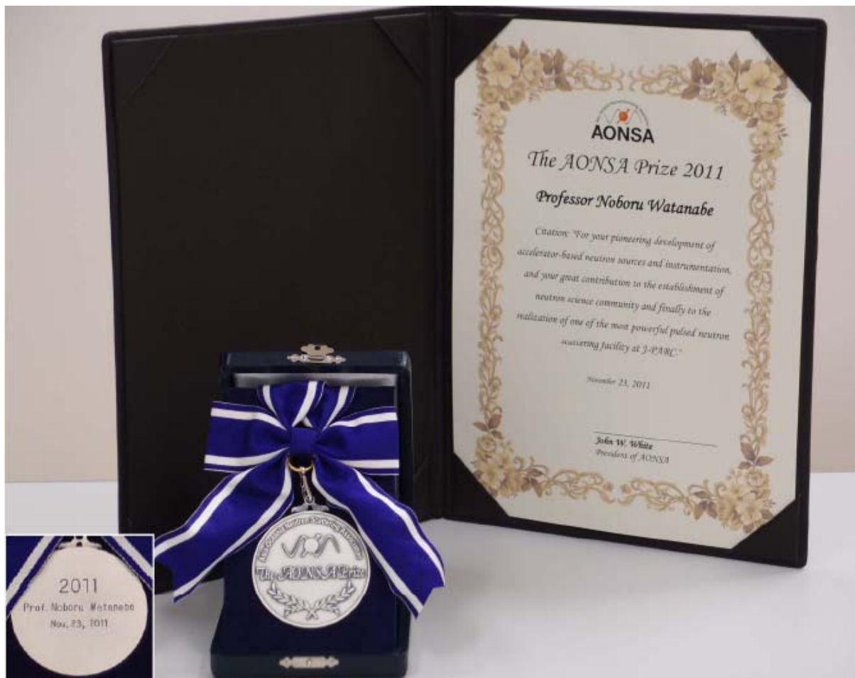
Prize Certificate (not yet signed by the President) and Medal (front and back faces)

If we estimate the next expenditures in 2013, it will be US$ 5,560 excluding travel support. Therefore, the balance after payment of the present prize will be able to cover one more time. Roughly speaking one-time expense will be US$ 8,000. The voluntary contribution to the fund will be available from Japanese institutions which have not made their contributions due to some legal procedures so far.