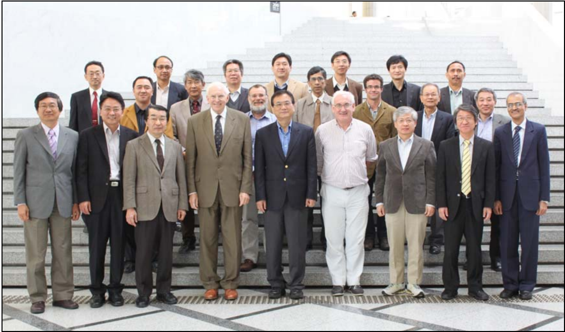
(Photo taken right after the 7 th EC meeting at the Tsukuba International Congress Center)